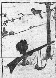
The Bird—But I ain't no crow. I'm a silhouette dove!