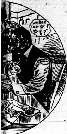
in Denver Rocky Mountain News.