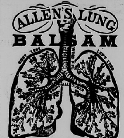
This engraving represents the Lungs in a healthy state.

STRICTLY PURE HARMLESS to the MOST DELICATE.