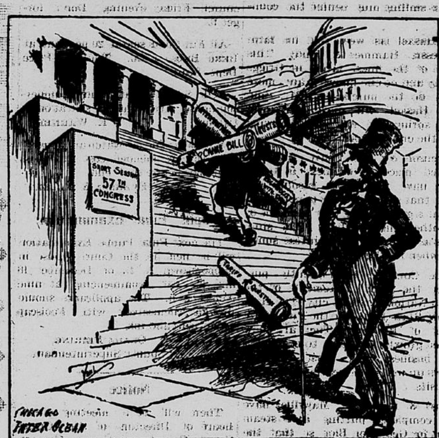
"Say, Suppose You Set le Those Questions Before You Shut Up Shop Again."

THE COMPANY WHOLE SAM'S WHOLESOME ADVICE. HE MY RECEIT