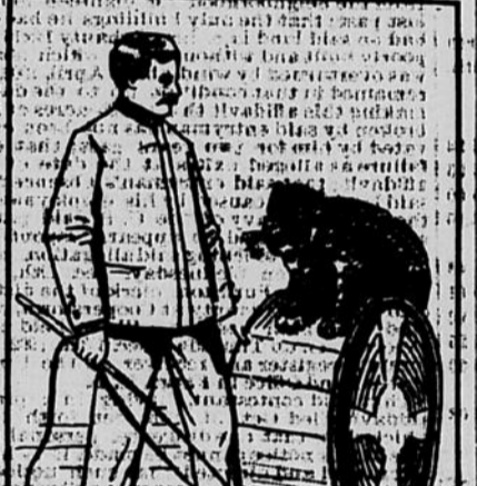
PUSS AND HER MASTER

"The lion is called the 'king of beasts,' I think it is because no one has ever had the chance to kill it... the leopard is king."