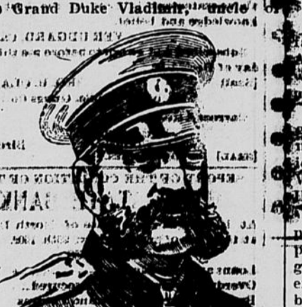
GRAND DUKE VLADIMIR (Uncle of Czar who has become ruler of the Russian Empire.)