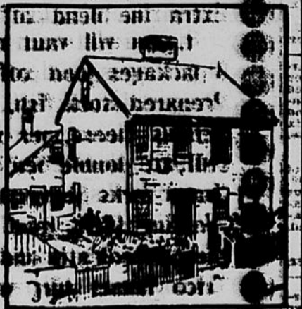
THE MITCHELL HOUSE (Birthplace of Famous Woman Astronomer at Nantucket.)