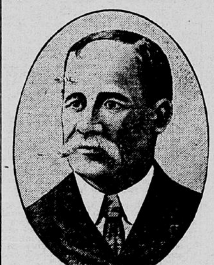
JOHN H. MICKEY. (Governor of Nebraska Who Objects to Balls and Full Dress.)