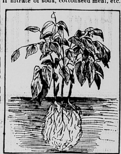
COWPEA PLANTS. (76.5 per cent, of the total nitrogen and 72. per cent, of the total dry matter

A number of fertilizer experiments have been made from year to year on double one $300. There is wood laid in cowpeas. This crop has been found the throat sufficient to start the fire; to respond readily to the mineral ferthen put in a layer of coal and then of tilizers, in particular to acid phosphate. limestone, continuing until it gets to the Numerous experiments have been made top of the opening. This is worked in to test the value of nitrogen along with phosphoric acid, but thus far no increased growth has apparently resulted who owns his own stone and wants lime from nitrogen, even on the poorest land.