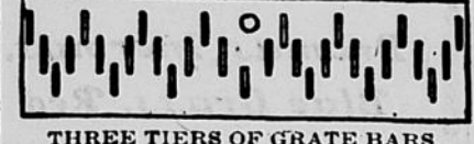
THREE TIERS OF GRATE BARS.

Until recently it was not apparent that the German engines were in this respect much, if any, in advance of those of other countries. The problem here, as elsewhere, has been to devise a metallic network fine enough in mesh to effectively sift the glowing sparks from the blast of a locomotive without so obstructing the draft as to compromise its steaming capacity. Hitherto the bars or filaments of network spark arresters have been mainly round and fixed in place—conditions which always entail