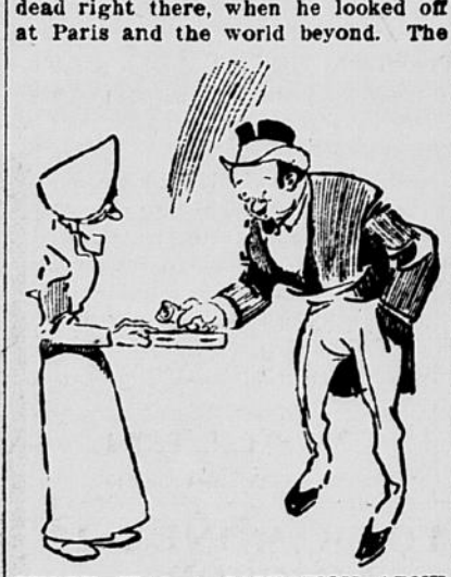
A SALVATION ARMY AND PUT IT IN THE TAMBOURINE