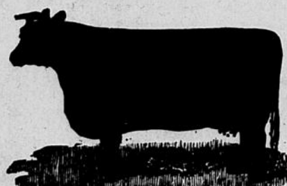
LADY FANNIE 9th.

Can fit you out with a young herd or single individuals as you may desire. Come and see them, you are always welcome.