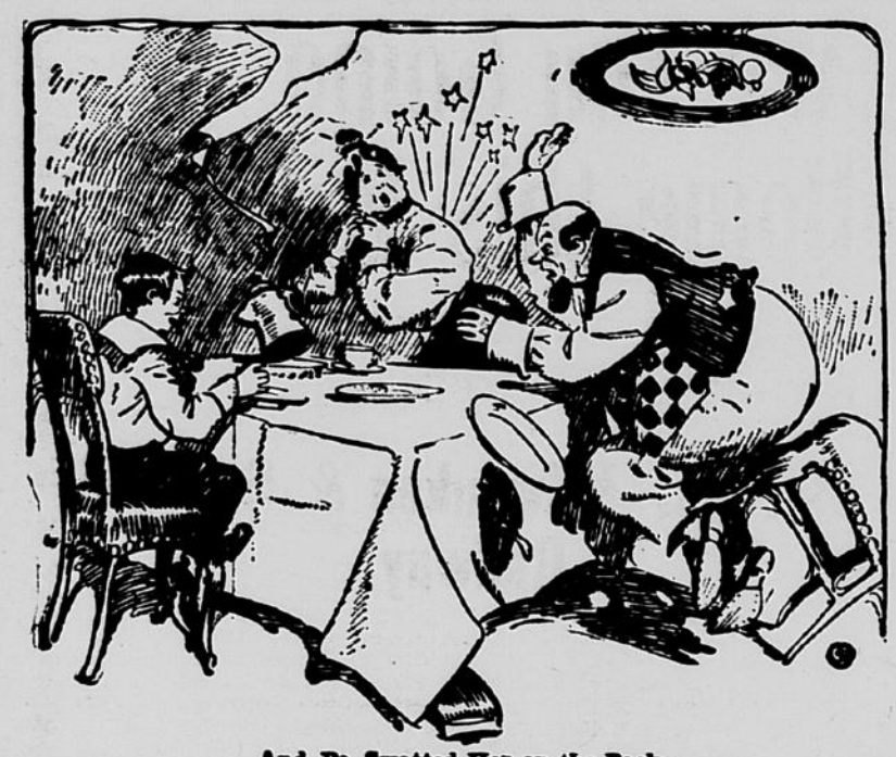
And Pa Swatted Her on the Back.

the angels stand, or a girl that is in Pa put his hand on my head and love, or an old maid that can't catch said: "Mother, Hennery will go with a man unless she writes down her me, to see that I do not get into any emotions and leaves them around so trouble as a circus financier and gensome man will read them, and swallow eral manager of the menagerie and the bait and not feel the hook in his Wild West aggregation, and hippogills, or a truly good bank cashier drome, in the great three-ring circus, who teaches Sunday school, and skips and you can stay home and give us