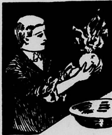
THE SNOWBALL BURNER.

The magician now rolls the mass into a nice, big snowball. Then he asks for a taper (your true magician never uses a match) and turns the empty pan bottom upward, placing