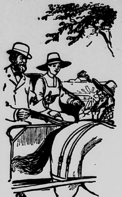
"GUESS YOU HAVE LOST, SENATOR."

In 1886 the late Senator Henry L. Dawes while driving near the town of Plainfield, not far from Cummington, a native town, lost his