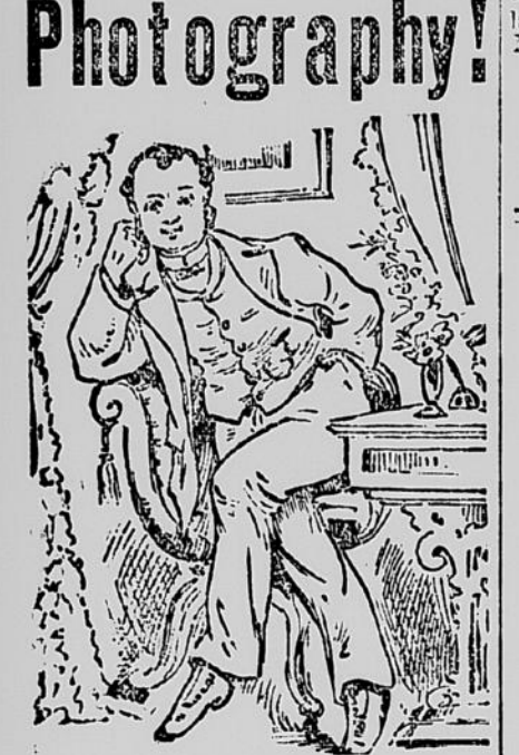
at reasonable prices. My work is guaranteed to equal that of any gallery west of Minneapolis. Give me a call.

qualit and character of the soil are concerned." The county is one of the smallest in the territory, 720 square miles in area, made up of gently rolling lands, lower than the coteau lands of the Missouri, and some 200 feet higher