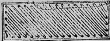
ROCKET LINE BOX.

In the upper portion of the picture is seen the box, with the points of the pegs around which the line is wound. The line is simply carried in and out about these pegs, which are sharpened at the point and reach nearly to the top of the box. In the lower part of the illustration the bottom of the box appears. A diagram of the inside is shown, as it appears looking down into the box. The line passing around the pegs is seen.