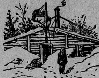
WINTER QUARTERS OF STONEY EXPEDITION.

Slowly but surely is the territory of Alaska forced to give up its secrets. Government and private expeditions have recently returned after visiting unexplored portions of this territory, while missionaries and mercantile companies are settling in the country for permanent conquest.