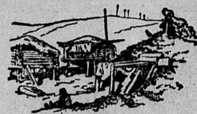
NATIVE HUTS AND CACHE.

Lake Ilamna is the largest body of fresh water in the territory. It requires from two to three days to cross from shore to shore. High mountains, some extinct volcanoes, others only partially smoldering, border on the lake. It has been supposed that Lake Balkal, in Siberia, was the only interior body of fresh water into which seals run up from the sea, but investigation proves that the spotted seal also frequents the waters of Lake Ilamna. Lake Teechak is another large body of fresh water, but its position has not yet been definitely placed upon any Alaskan chart. The natives at Nushegak and upon the Alaska peninsula are docile, and possess similar traits to those of the Eskimo race. Schools are about to be established among them. Although perhaps without much success at the outset, they may eventually be somewhat educated. At present the people want the teachers to pay them to come to school. Many of these natives are members of the Russo-Greek church, a resident priest having dispensed religious comfort to them for a number of years.