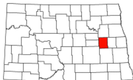
Locations where fossils have been found