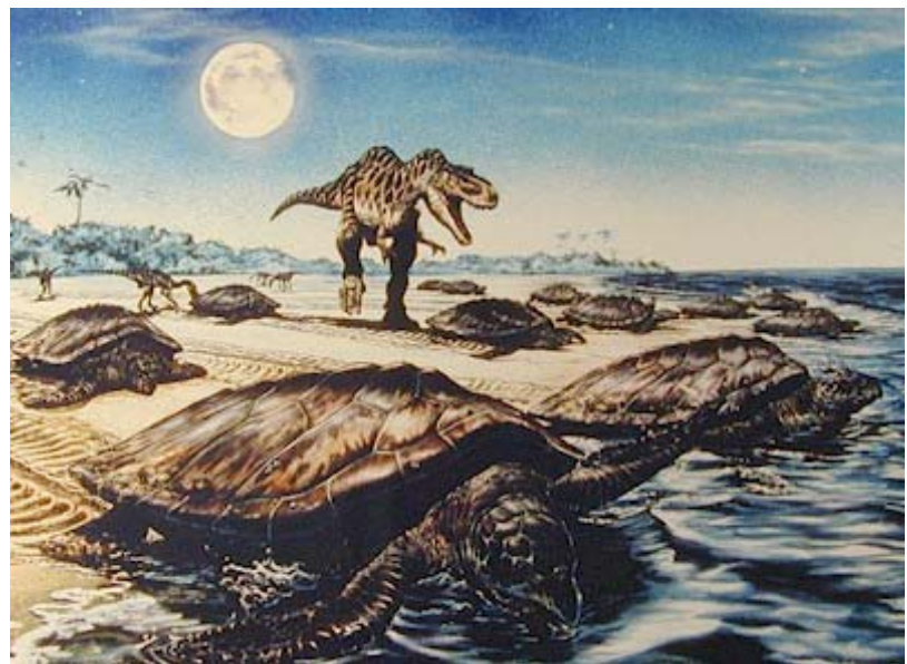
Archelon turtles on a Pierre Sea shore during the Cretaceous escaping from a Tyrannosaurus rex . Painting by Mark Hallett.

Archelon was one of the sea turtles that lived in the Western Interior Seaway that covered North Dakota during the Cretaceous. Archelon grew to lengths of 15 feet. Sea turtle fossils are extremely rare in North Dakota. These turtles laid their eggs on land and were vulnerable to attacks by predators, such as predatory dinosaurs at those times.