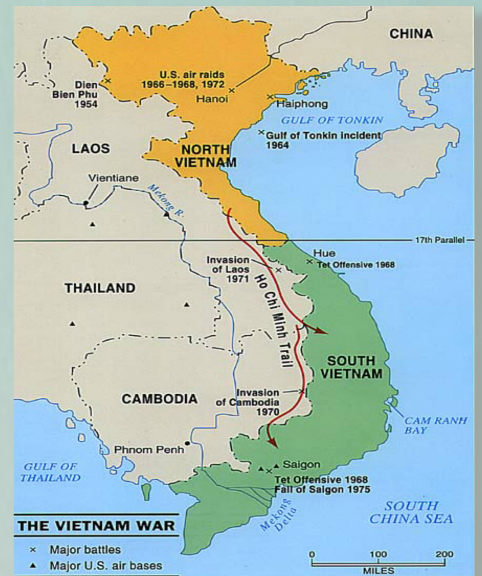
Map of Vietnam

The war was largely successful in that regard. Communism never spread beyond Laos and Cambodia and it only survived in those two countries from 1975 to the mid-1980's.