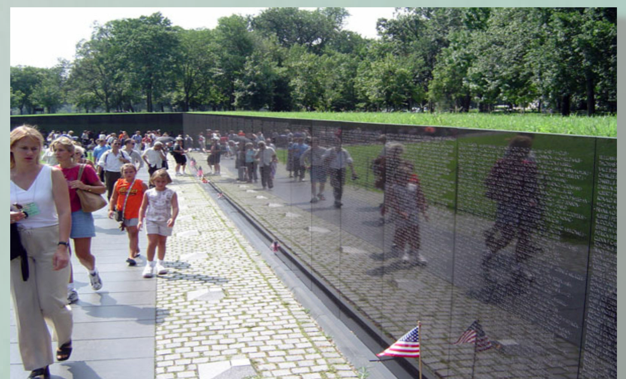
Vietnam War Veterans Memorial Washington