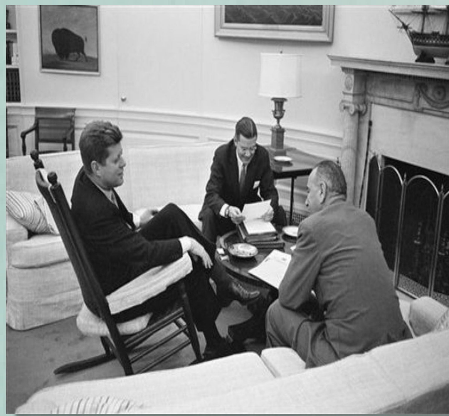
Robert McNamara, architect of the Vietnam War with President Kennedy. McNamara oversaw the massive buildup of U.S. Forces in Vietnam between 1964 and 1969.

The Cold War lasted 46 years and the 16 years of the Vietnam war made up 35% of that time period. A total of 2,594,000 Americans served in Vietnam and as of 2010 there were American 58,267 names of those Killed In Action on the War Memorial.