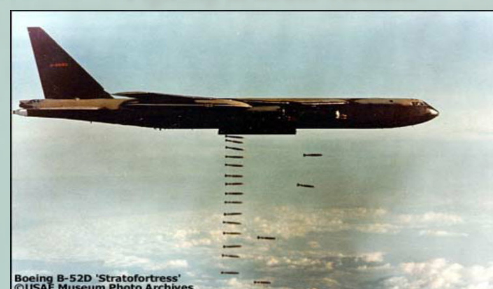
Bombing run in Vietnam