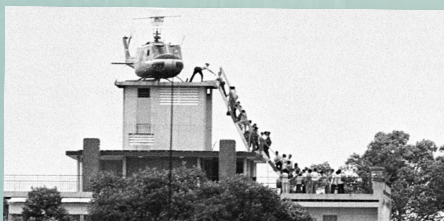
March through April 1975 the North Vietnamese army obtains control of all of Vietnam. The South Vietnamese government collapses. All Americans are evacuated by helicopter in a state of emergency.