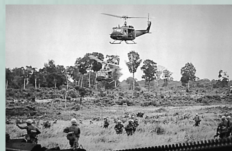
Fighting in South Vietnam